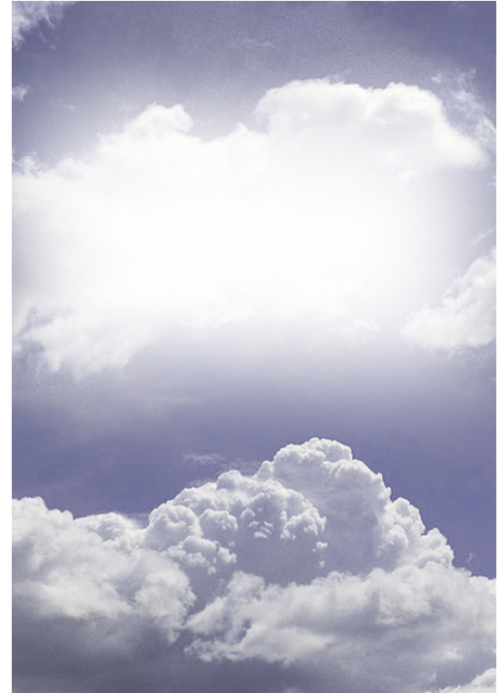
Image with the transparency mask applied.

Darker mask values result in more transparent image values.